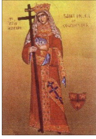
St Helena, patron saint of Colchester

There was much instability within the Roman Empire, in the late 4th century and life in Britain was becoming more and more difficult. Coins were no longer being minted, soldiers were not being paid and the whole system of trade was collapsing. Without money to pay for goods, products such as pottery, were not being produced in any quantity and bartering must have started to take over. By 410AD the